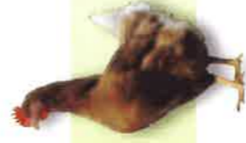
Tableau bord Isa plein air